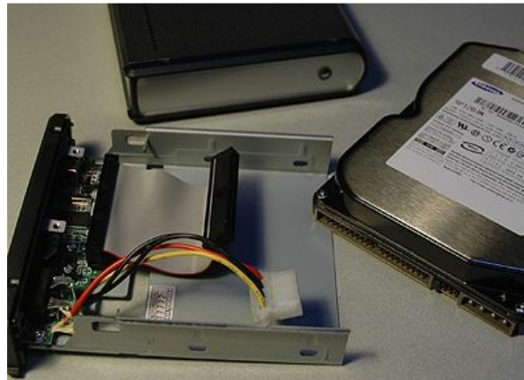
Image 1.3 USB drive kit Source: (Computer Desktop Encyclopedia, 2008)

From Computer Desktop Encyclopedia © 2006 The Computer Language Company, Inc.